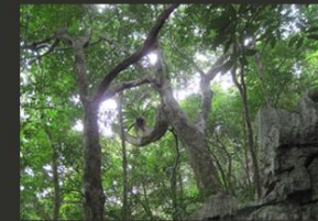
- Trekking in forests -