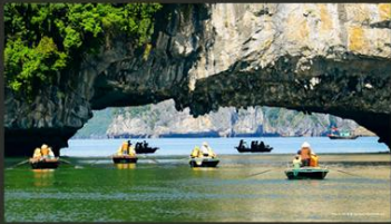
- Fishing and rowing -