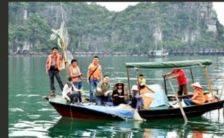
- Involving educational programs and activities -