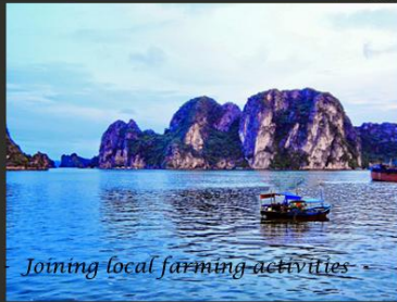
- Joining local farming activities -