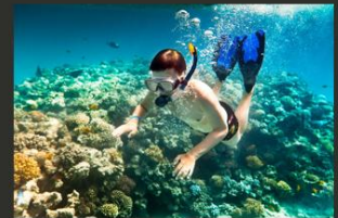
- Scuba diving and swimming -