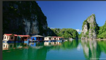
- Experiencing community based tourism service -